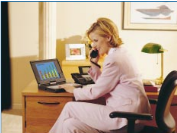
Talk and send data at the same time.

All Panasonic 7200 and 7400 series digital phones feature an extra RJ-11 jack. This "eXtra Device Port" (XDP) enables you to connect any single-line device directly to your phone, instantly expanding your connection capacity and allowing you to use both communications devices simultaneously. Plug in a cordless phone, fax machine, answering device, laptop, modem or credit card verifier. Now you're able to talk on the phone while faxing, transmitting a data file or even surfing the Net!