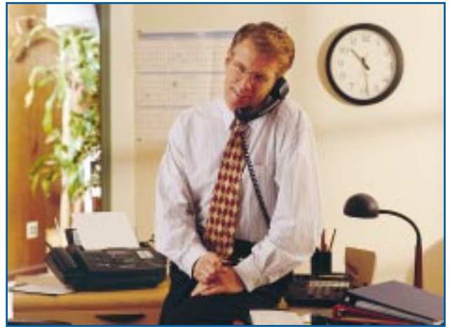
Talk while sending or receiving a fax.